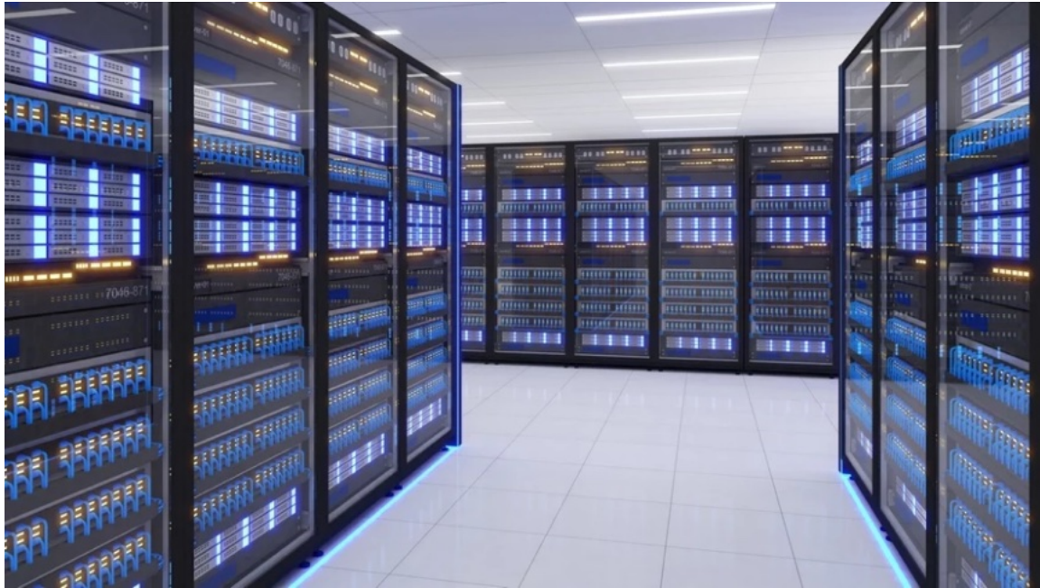
Figure 2 Illustrative data centre infrastructure

Against this backdrop, Aurora's Stage 1 BESS project has now completed the final technical requirements required by AEMO before execution of a TCA. This milestone follows AEMO's acceptance of Generator Performance Standards for the Aurora BESS under Clause 5.3.4 and moves the 140 MW / 280 MWh BESS project to the final stage of commercial access negotiations.