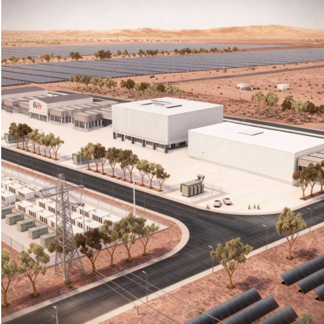
Figure 1 AI render of Aurora Energy Precinct

Recent reports highlight growing interest from major AI infrastructure companies in large-scale data centre developments in Australia, including discussions involving Anthropic 2 and proposed projects at gigawatt scale. This reflects a broader shift toward AI campuses requiring hundreds of megawatts to multi-gigawatt capacity.